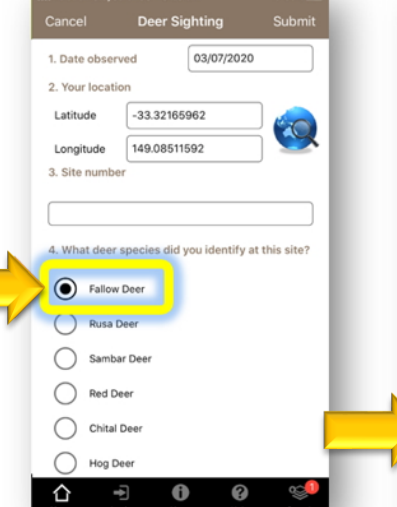
The date and location will automatically appear. Answer all relevant questions.