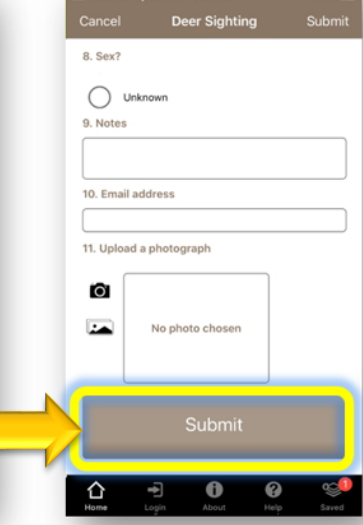
Upload a photo (optional) then select 'Submit'.