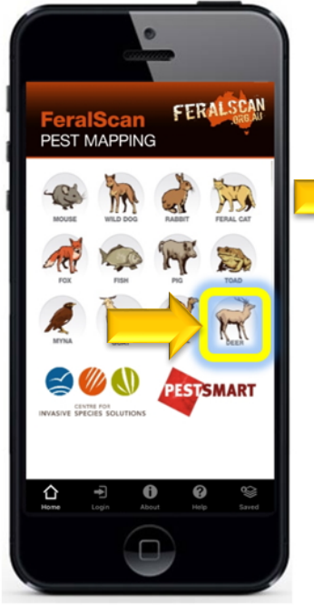
From the app home screen select the wild deer image.