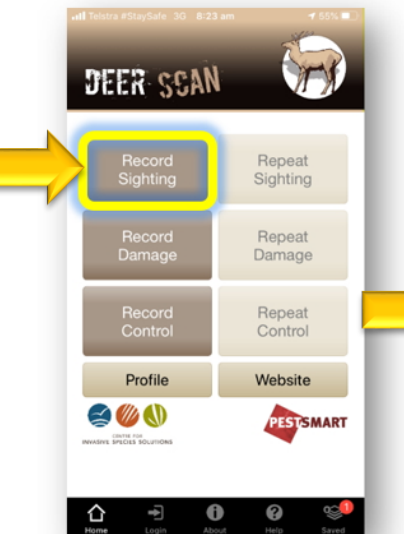
Select either the 'Sightings' 'Damage' or 'Control' buttons to begin recording.